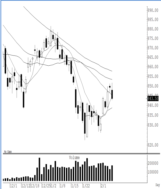
S50H24 (Close 843.50 Chg -5.80)